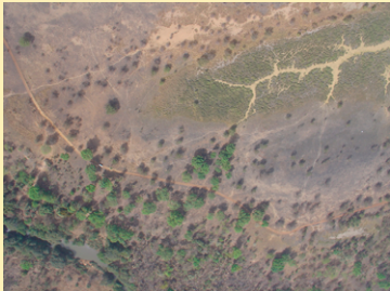
taken with a drone