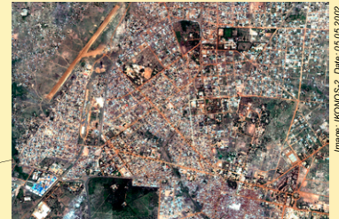
Image: IKONOS-2, Date: 05.05.2002