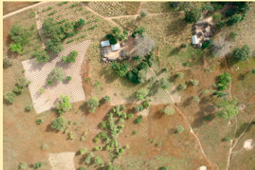
taken with a drone